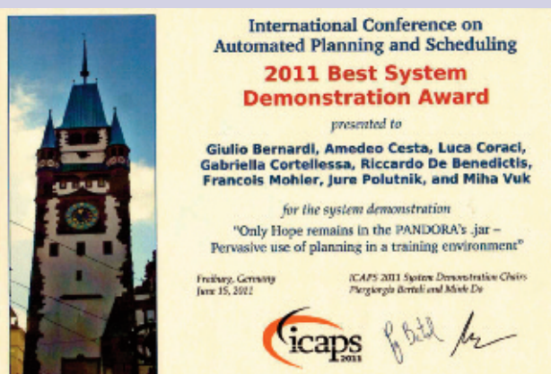
The award certificate for the Best System Demonstration at ICAPS 2011

(see http://icaps11.informatik.uni-freiburg.de/demos for further info)